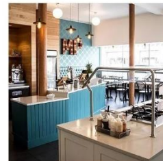
Maple Parlor Location: Hawthorne Street Portland Scope: Full Retail Design