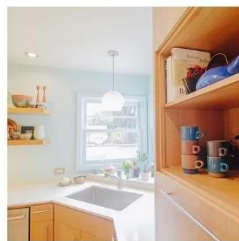
Modern + Airy Location: Northeast Portland Scope: Kitchen + Bathroom Remodel