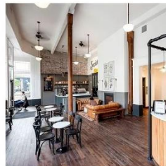
The Society Hotel Location: Chinatown Portland Scope: Full Hotel Interiors