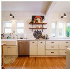
Eclectic + Functional Location: Laurelhurst Neighborhood Portland Scope: Kitchen Remodel