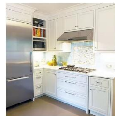
Traditional Revamp Location: Ladd's Addition Portland Scope: Kitchen Remodel