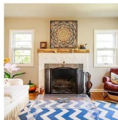
Home For A Young Family Location: Richmond Neighborhood Portland Scope: Home Remodel